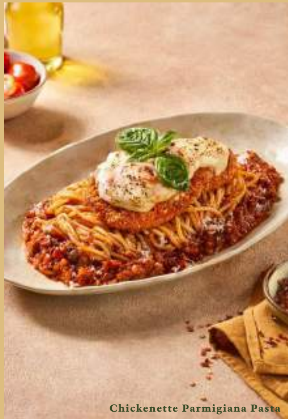
Chickenette Parmigiana Pasta