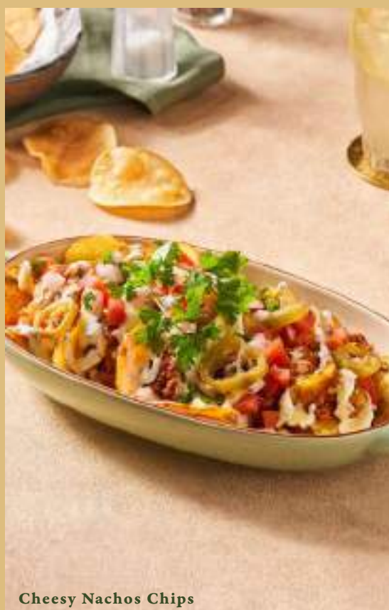
Cheesy Nachos Chips