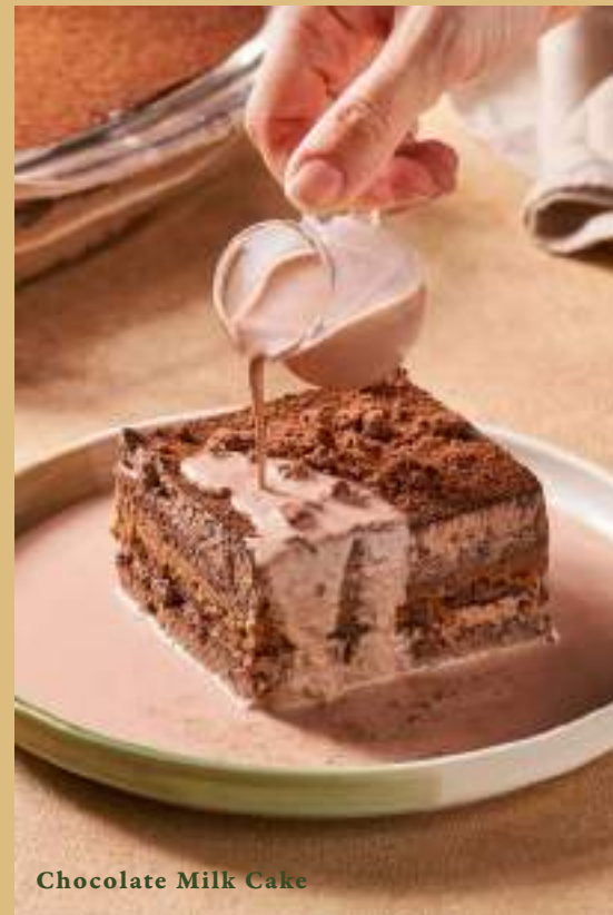
Chocolate Milk Cake

Soft layers of milk chocolate cake topped with creamy whipped cream, crunchy chocolate biscuit crumbs, and served with milk syrup