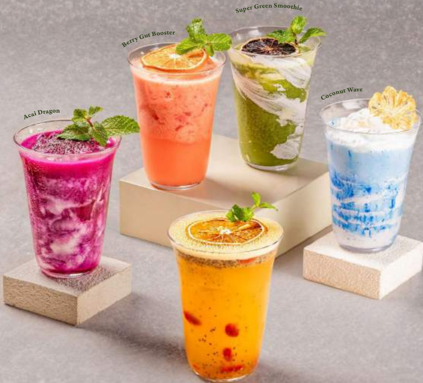
Chia Coconut Citrus