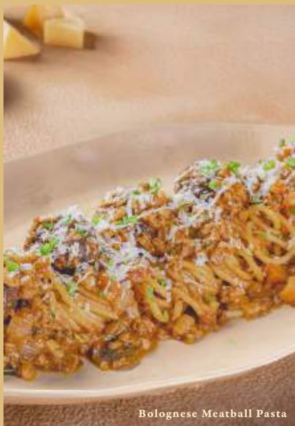
Bolognese Meatball Pasta