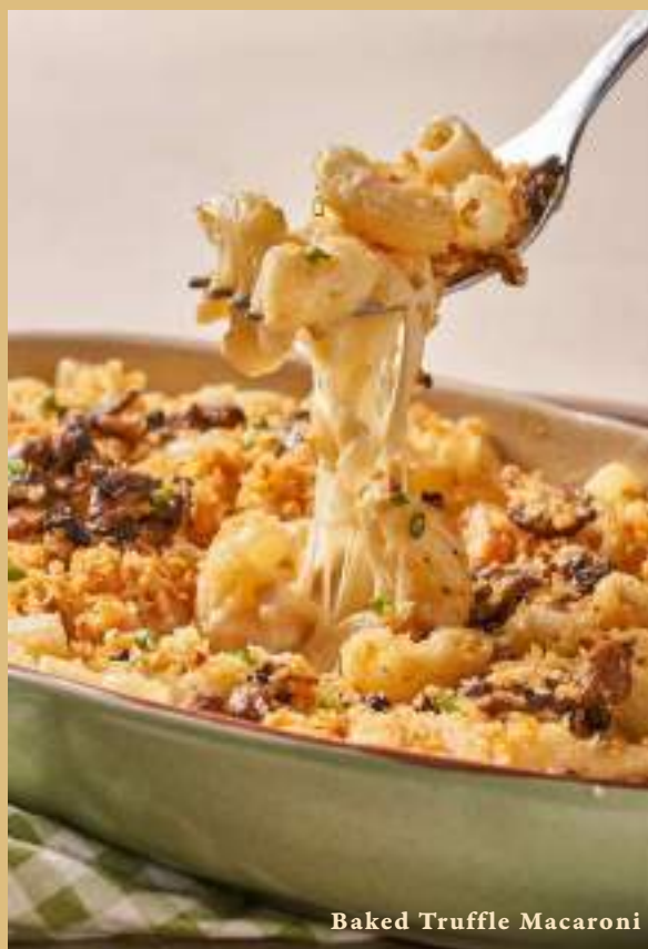
Baked Truffle Macaroni