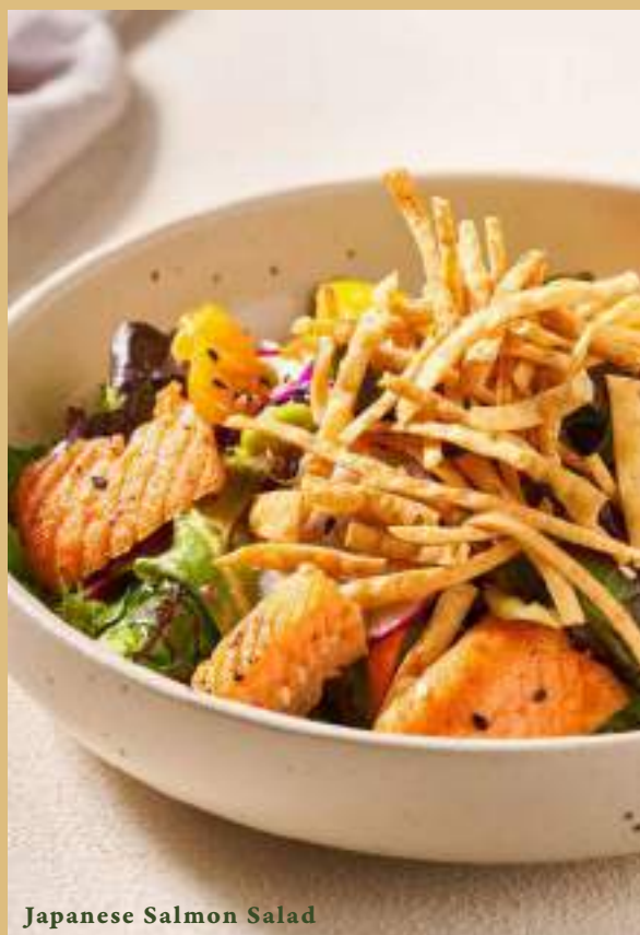
Japanese Salmon Salad