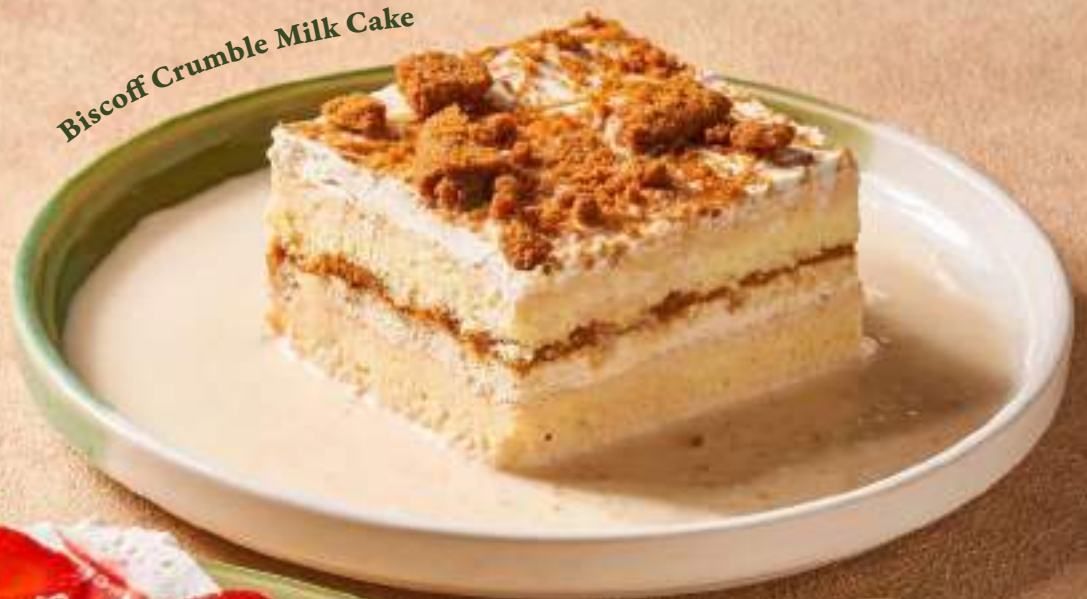
Biscoff Crumble Milk Cake