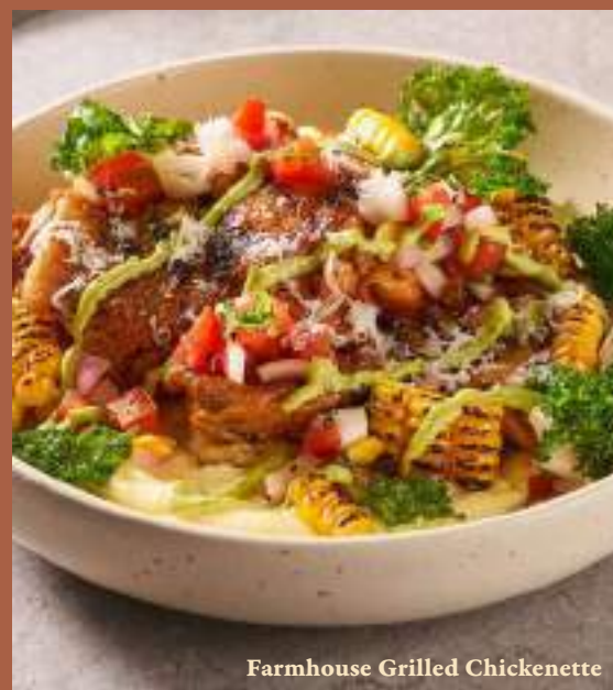
Farmhouse Grilled Chickenette

Half roasted Chickenette served with potato gratin, fresh mix salad, and creamy garlic butter sauce