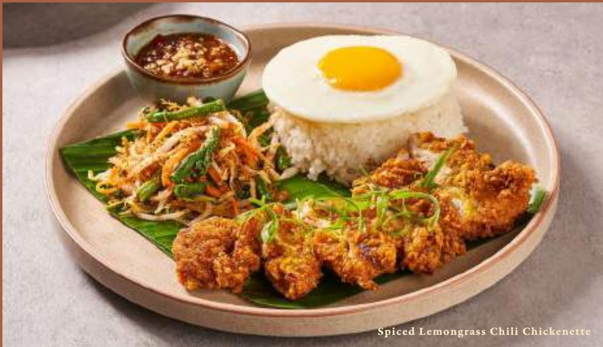
Spiced Lemongrass Chili Chickenette