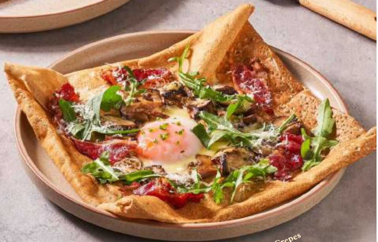
Smoked Beef Carbonara Crepes