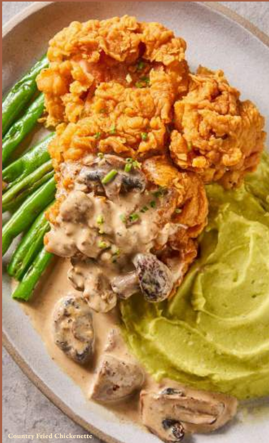
Country Fried Chickenette

Chickenette meat might exhibit a slight pink color due to the brining process, which extracts marrow from the bones. This is natural and perfectly safe to eat, indicating the thorough brining that ensures the meat is exceptionally tender and flavorful.