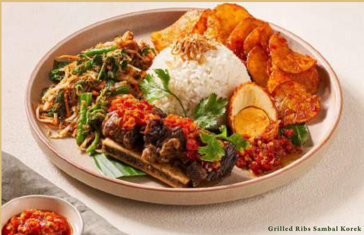
Grilled Ribs Sambal Korek