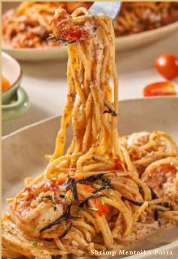
Shrimp Mentaiko Pasta