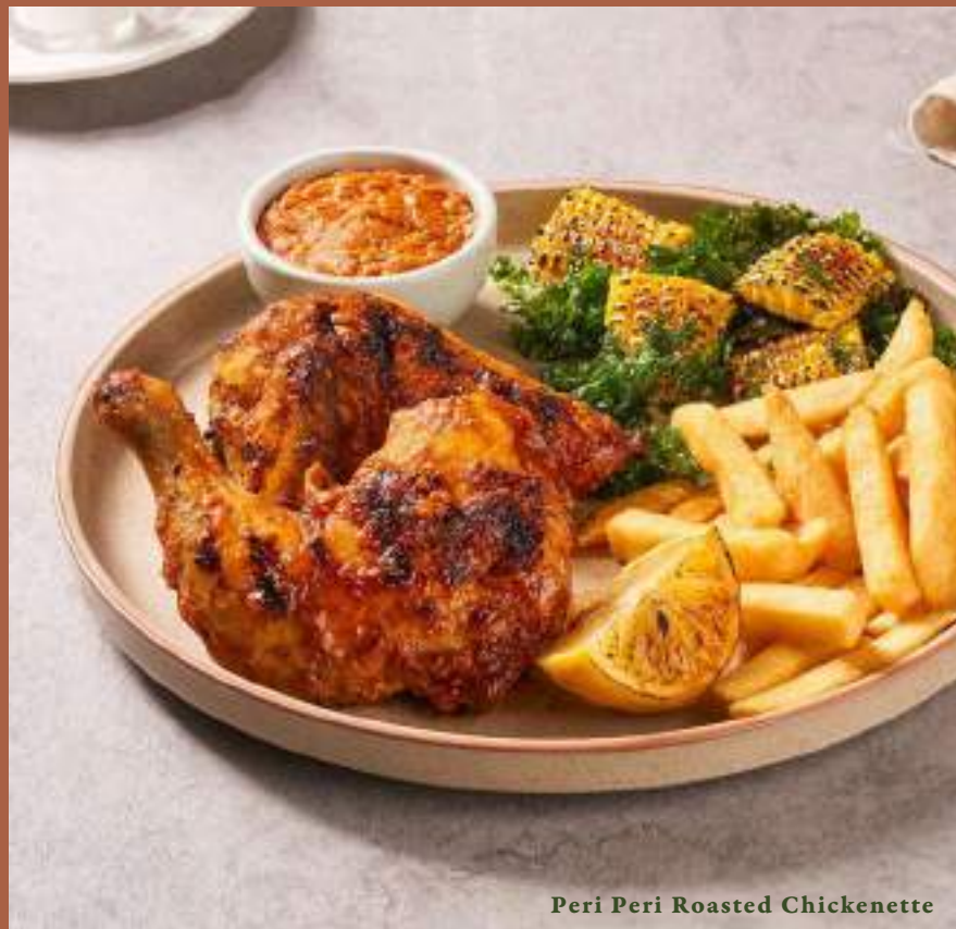
Peri Peri Roasted Chickenette