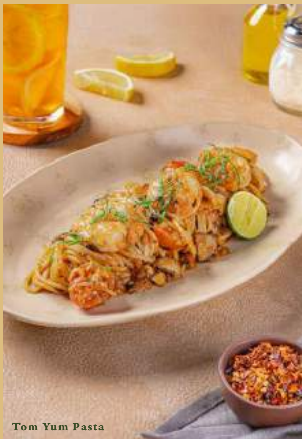
Tom Yum Pasta