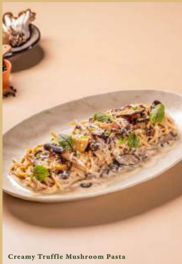
Creamy Truffle Mushroom Pasta