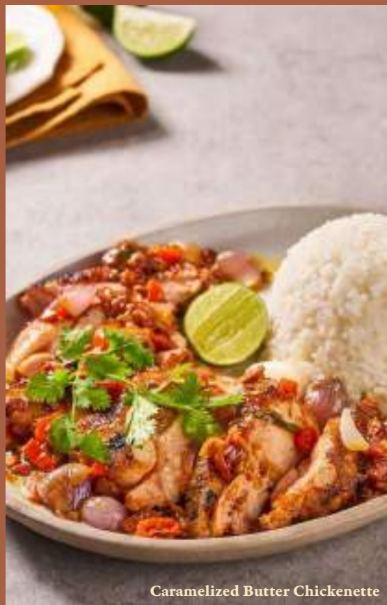
Caramelized Butter Chickenette

Grilled Chickenette thigh cooked with caramelized butter with whole garlic & shallots and chopped beef bacon, served with rice