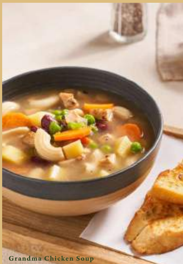
Grandma Chicken Soup