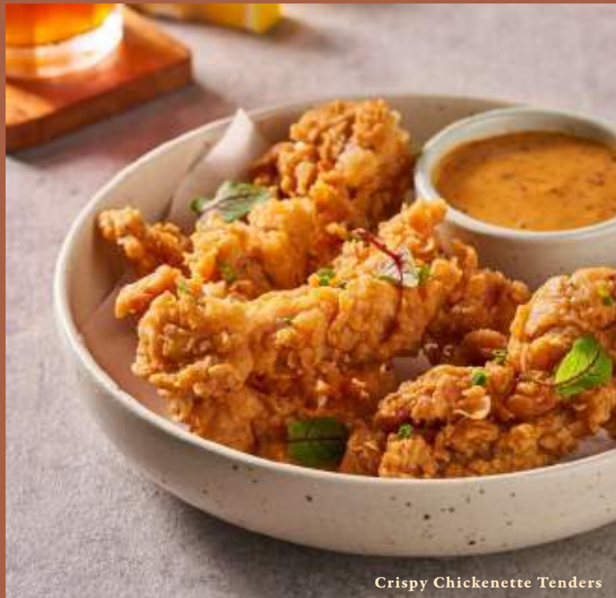
Crispy Chickenette Tenders