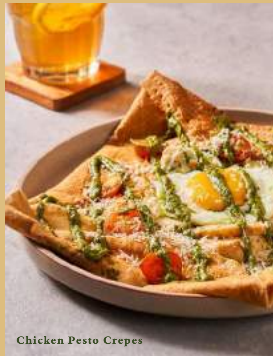
Chicken Pesto Crepes

Crispy savory crepes with sautéed mix-mushrooms, truffle oil, béchamel sauce, and Parmesan cheese