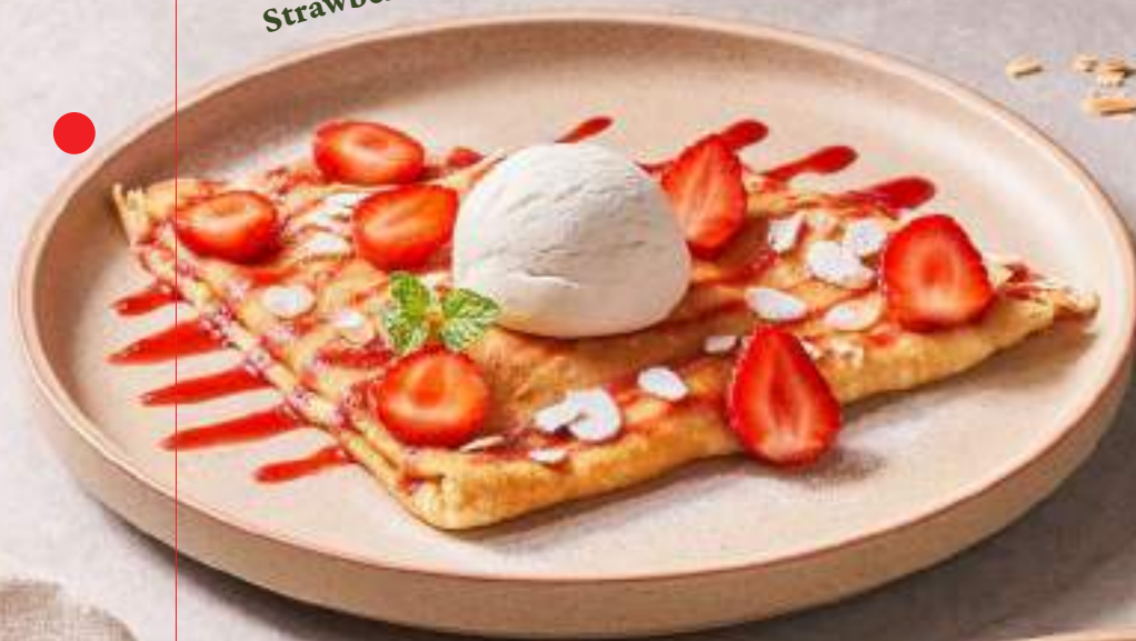
Strawberries & Creme Crepes