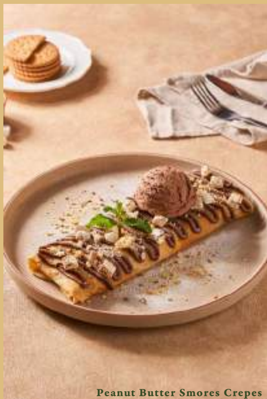
Peanut Butter S'mores Crepes

Soft crepes filled with peanut butter cream, topped with milk biscuit crumbs, chocolate hazelnut sauce, and ice cream